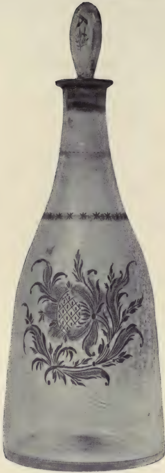
BOTTLE, OR DECANTER San Ildefonso